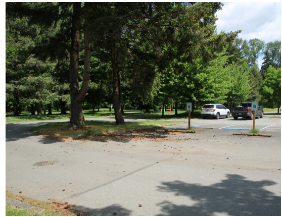
Tibbetts Beach parking

Sunset Beach: There are gendered restrooms and changing areas located at the concession building; however they were closed at the time of this writing. There are four all gender, accessible family restrooms as well; two on each side of the building. These single restrooms have grab bars and child-size changing tables, with flush toilets and sinks. The restroom on the south side of the building (closest to the parking lot) next to the women's restroom and the restroom on the north side (closest to the lake) next to the men's restroom have the lightest doors to open. All of them have a 34 inch wide door.