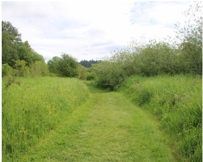
A view of the Orchards Loop trail through mowed grass

This trail begins from the end of the Kitchen Shelter Area, but you have to take a cracked paved path or cross the grass lawn to get to it. The loop travels mostly through a field with a few wooded areas and a small orchard. It is generally flat, with the exception of one short, steep grade, but is mowed grass and very uneven with lots of dips, rolls, and holes and only one bench. If you are comfortable walking on that kind of surface, then there are lots of birding opportunities along the way.