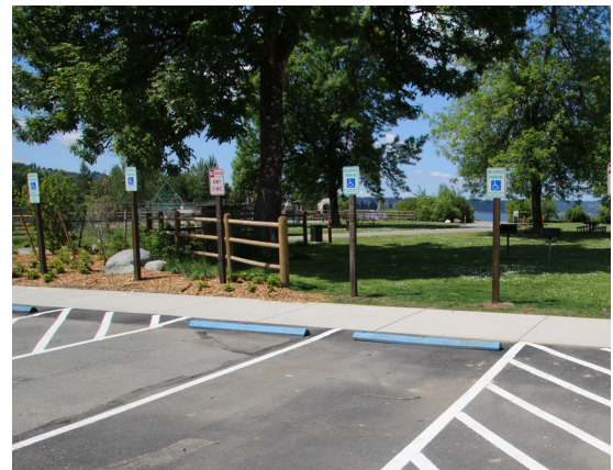
One of the sections of accessible parking at Sunset Beach