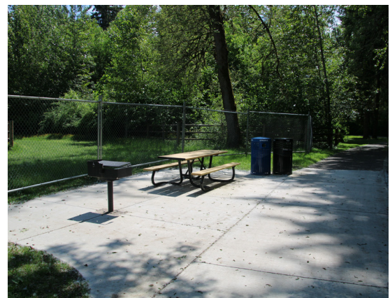
The accessible picnic table along the Sunset Beach to Tibbetts trail.