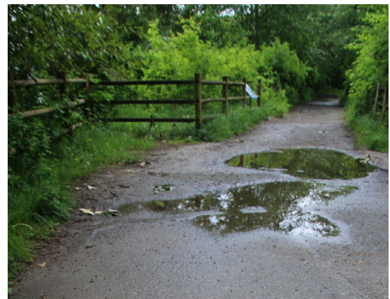
Where the Wetland Trail transitions to natural surface.