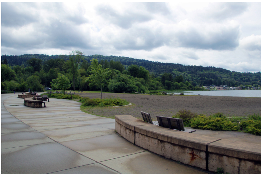
A view of Lake Sammamish and the benches at Sunset Beach.

The beach is sandy but has flat access from the sidewalk to the waterfront and would be accessible with a beach or all-terrain wheelchair. There is a clear line of sight from the sidewalk to the water, with several benches on the sidewalk along the beach. There is also a playground with an accessible surface and a picnic shelter and tables.