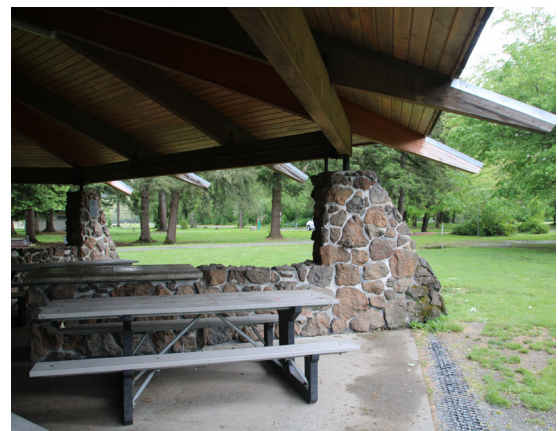
The Rotunda Shelter with a view of the transition between the grass and concrete pad.