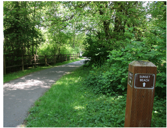
The paved trail between Sunset and Tibbetts Beaches.

At 0.1 miles you reach a boardwalk with a 1.5 inch lip. The boardwalk is generally six feet wide and level with edge guards but can be a bit slick. You travel through a lush forest and wetland area surrounded by salmonberry and other plants. The boardwalk ends at a large overlook of Issaquah Creek and the lake.