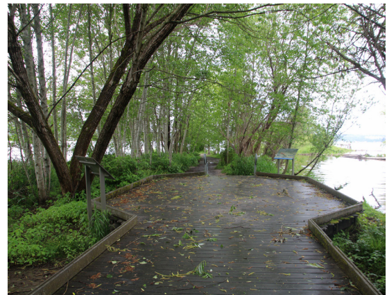
The overlook of Issaquah Creek at the end of the boardwalk