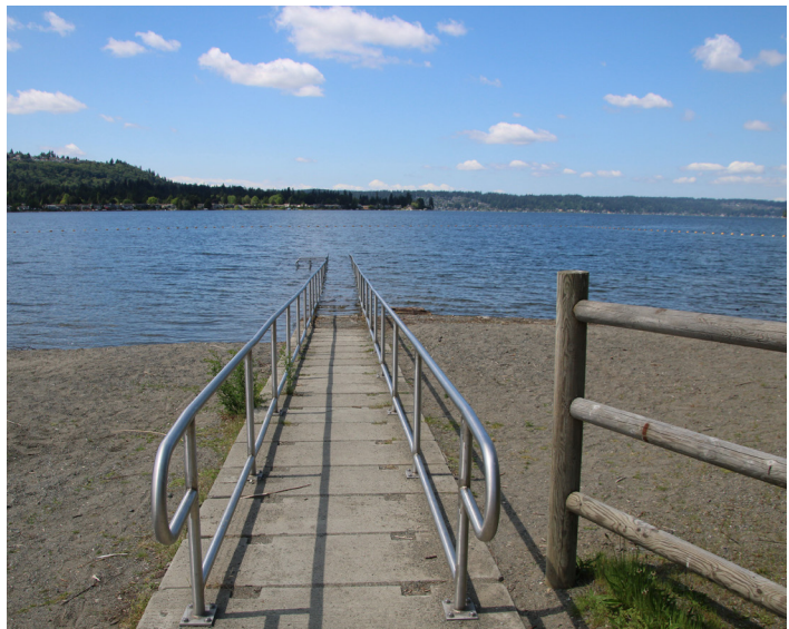
The accessible kayak launch into the lake.

Kayak launch: There is an accessible kayak launch at Sunset Beach. The concrete ramp has handrails and leads directly into the water. I could not find a transfer bench.