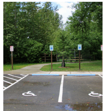
The picnic table at the east end of the Sunset parking area.

Lake Sammamish has been important to many tribes in the southern Salish Sea region since time immemorial. The Snoqualmie People had several villages along sqTawxTxTačúT (the traditional place name for the lake in Lushootseed). You can learn more about how the Snoqualmie Tribe is restoring culture and life back to Lake Sammamish at this ArcGIS StoryMap .