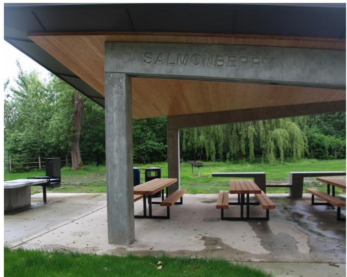
Salmonberry shelter at Sunset Beach

Sunset Beach: As described in the suggested activities section, there are several accessible picnic tables and shelters at Sunset Beach.