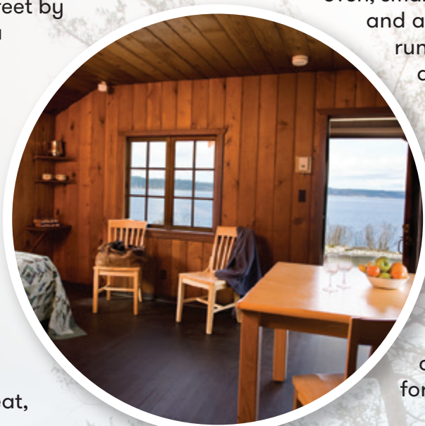
table and chairs and a kitchenette with a full-size refrigerator/freezer, microwave oven, small four-cup coffee maker and a sink with hot and cold running water. These cabins do not have a bathroom; the full-service bathhouse is located behind the row of cabins. Guests need to bring along their own bedding, pillows, towels, dishes, utensils, cookware and cookstove.

Standard cabin amenities include electric lights and heat,